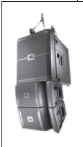
Sho n i h VRX928LA and op onal VRX-SMAF Arra Frame

The enclos re is cons rced of op q ali birch pl ood, coa ed in JBL s r gged D raFle m nish and is hea il braced o ma imize lo -freq enc performance. The a rac i e CNC-machined, 16-ga ge s eel grille is ernall lined i h ac s icall ransparen foam o pro ide addi onal dri er pro ec ion and gi e a er professonal appearance. The rear of he enclos re is ed i h T-n s i hich ma be used o a ach he op onal WK-4 cas er ki .